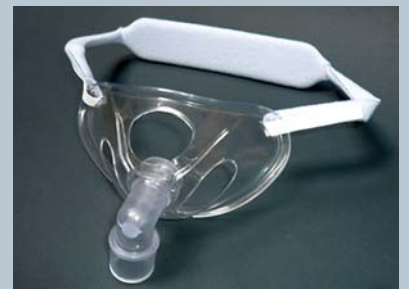
Comfort Strap TCS-1005